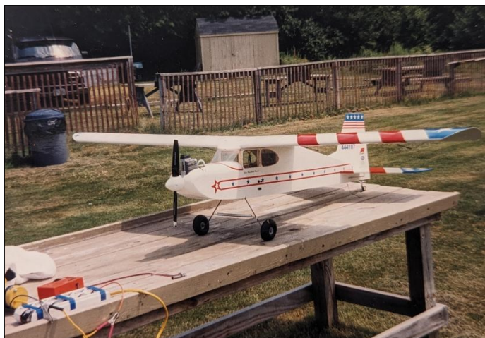
July 2002—Kadet Senior highly modified by Jerry Howard. Crashed on third flight due to lost radio signal. Remains were rebuilt in August 2002.