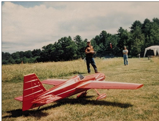
1994—Lew Parish's Laser with .50 engine, and 86" wing at Hobbs Field. Includes monocoque covering, and Bennit Smoke System. Airtronics transmitter. Flies great!