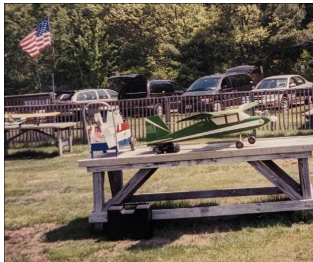
June 2001—Senior Kadet at RC Aces Field in Hampton, NH