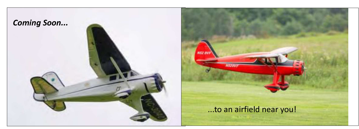
RCACES Tailwind Newsletter—May 2025